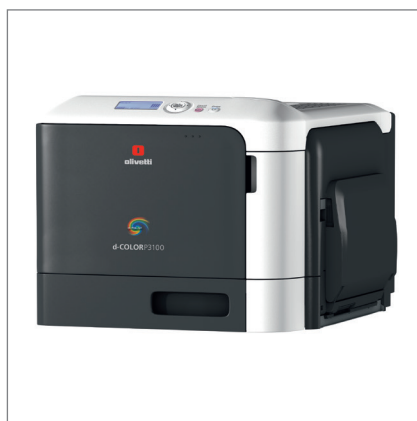
Professional A4 colour printer with stylish design