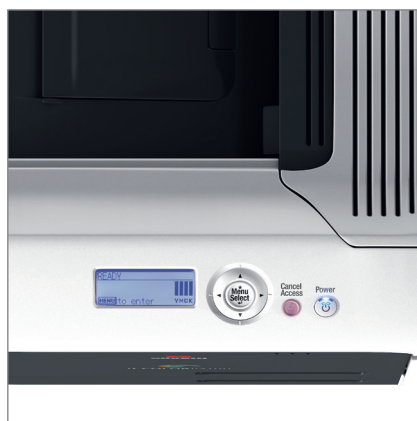
4-line LCD operator panel