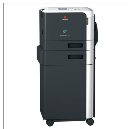
3 input paper trays (optional)